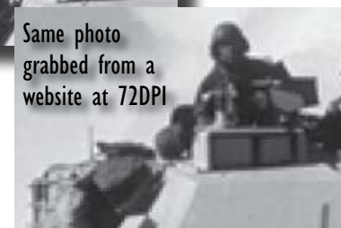
Same photo grabbed from a website at 72DPI

If you absolutely have to have those national current events photos (and we really wish you didn’t) and you don’t want to use World Beat or What’s Up (and we really wish you would) then you can purchase those types of photos from KRT Campus. They are a national wire service for college newspapers who will sell you individual national and international news photos or they have a year-in-review package that is fairly spendy. You can find them at www.krtcampus.com . ✕