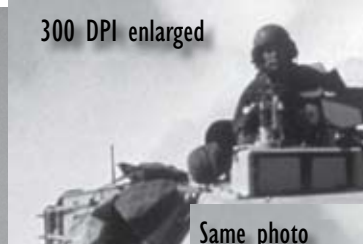
300 DPI enlarged