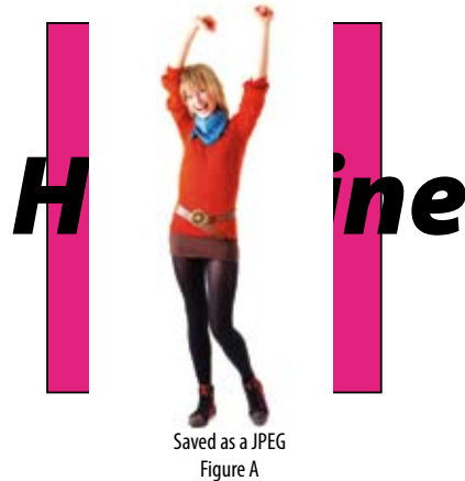
Saved as a JPEG Figure A