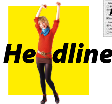
Saved as a TIFF with Transparency Figure E